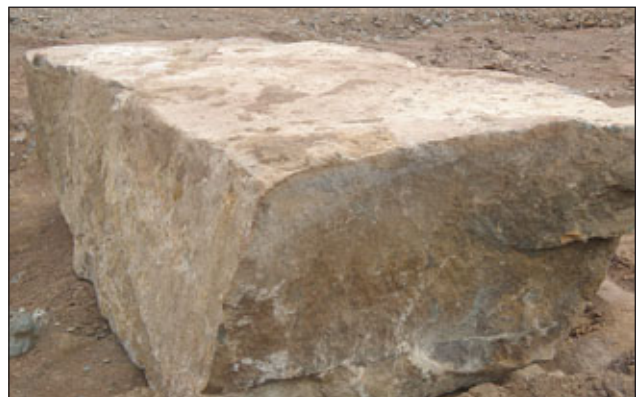
Large individually selected rocks