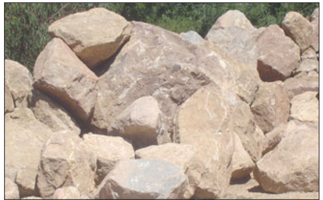
Erosion Control and Gabion Rock in various sizes