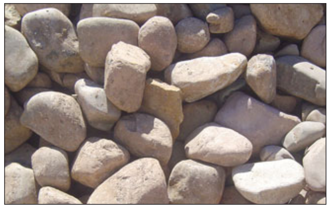
100mm+ River Spalls