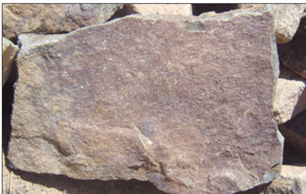
Feature Wall, Landscaping and Facade Stone in various sizes