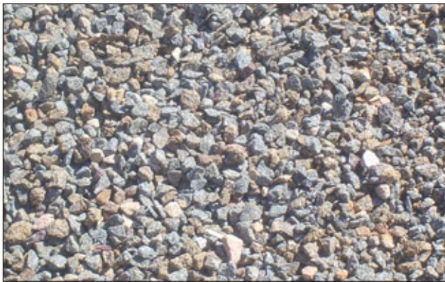
Crushed Gravels C1 to C4 Aggregates 7mm, 14/10mm, 20mm, 30mm