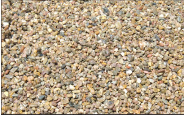
7mm Washed Round Stone